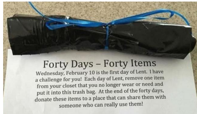
This is an old picture so the date is wrong.

This year, Lent starts on Wednesday 5 th March. Traditionally, Lent is when we forego things we enjoy – chocolate, sugar, puddings! This year, why not find items you no longer want or need (or fit into) and make a collection to donate for others to benefit. Bring them to chapel or take them to your charity of choice. ~~~~~